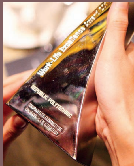
The Work-life Excellence Award for Republic Polytechnic is a nod to the HR team's efforts.